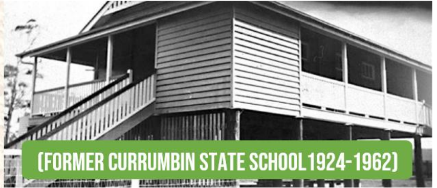
(FORMER CURRUMBIN STATE SCHOOL 1924-1962)